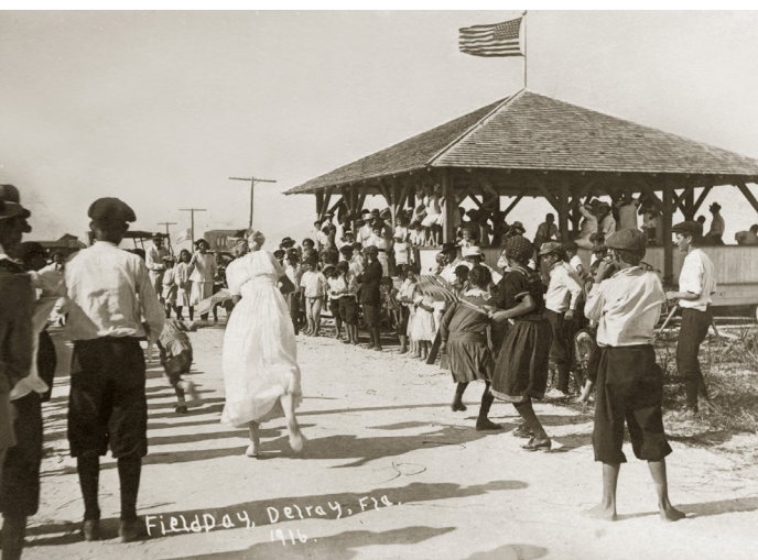
Field Day, 1916