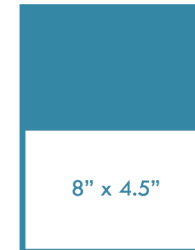
1/2 PAGE (H)