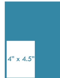
1/4 PAGE (V)